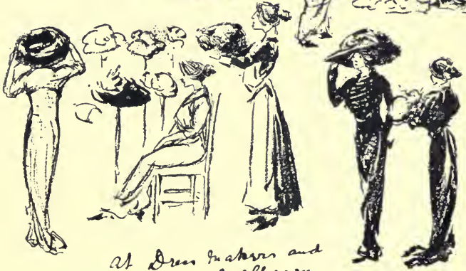
At Dress Makers and Millinery